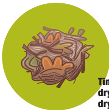
Tinder – small twigs, dry leaves or grass, dry needles.