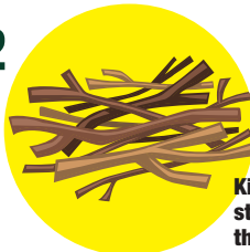
Kindling – dry sticks smaller than 1" around.