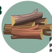
Firewood – larger, dry pieces of wood up to about 6-8" around.